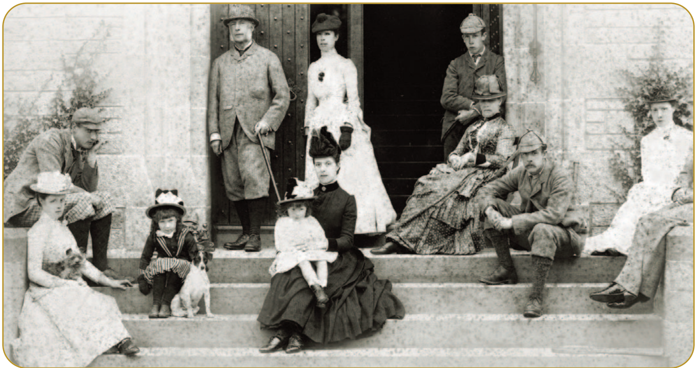
The family on the steps of Fairburn House