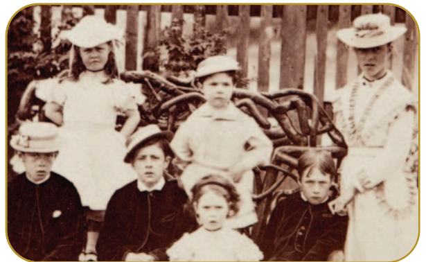
The Stirling children