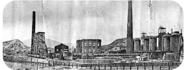
Cleator Moor Iron Ore Works