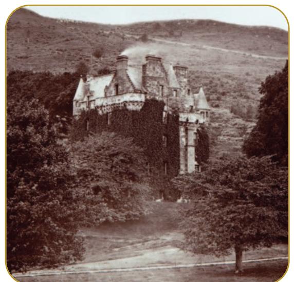
Castle Leod, Strathpeffer