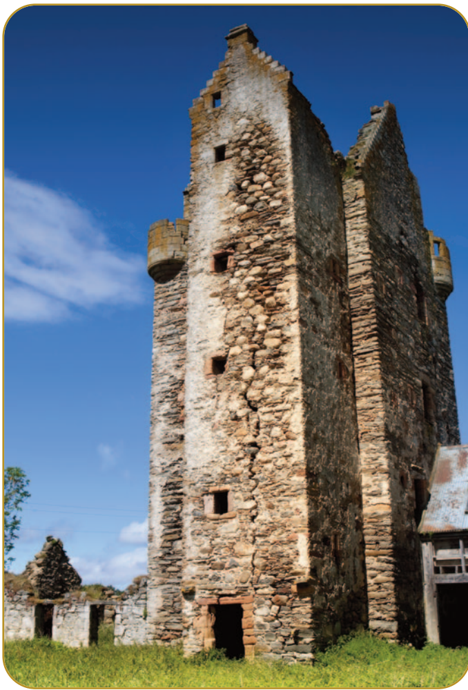
Fairburn Tower 2011