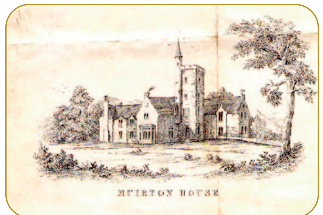
Muirton House which was demolished to make way for Fairburn House