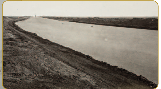
The Suez Canal