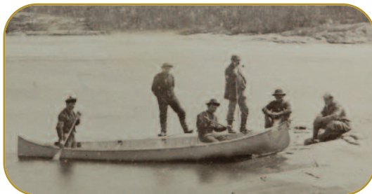
View of the Romaine river