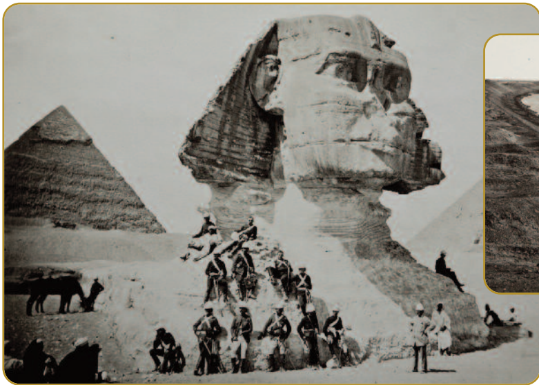
The Great Sphinx of Giza