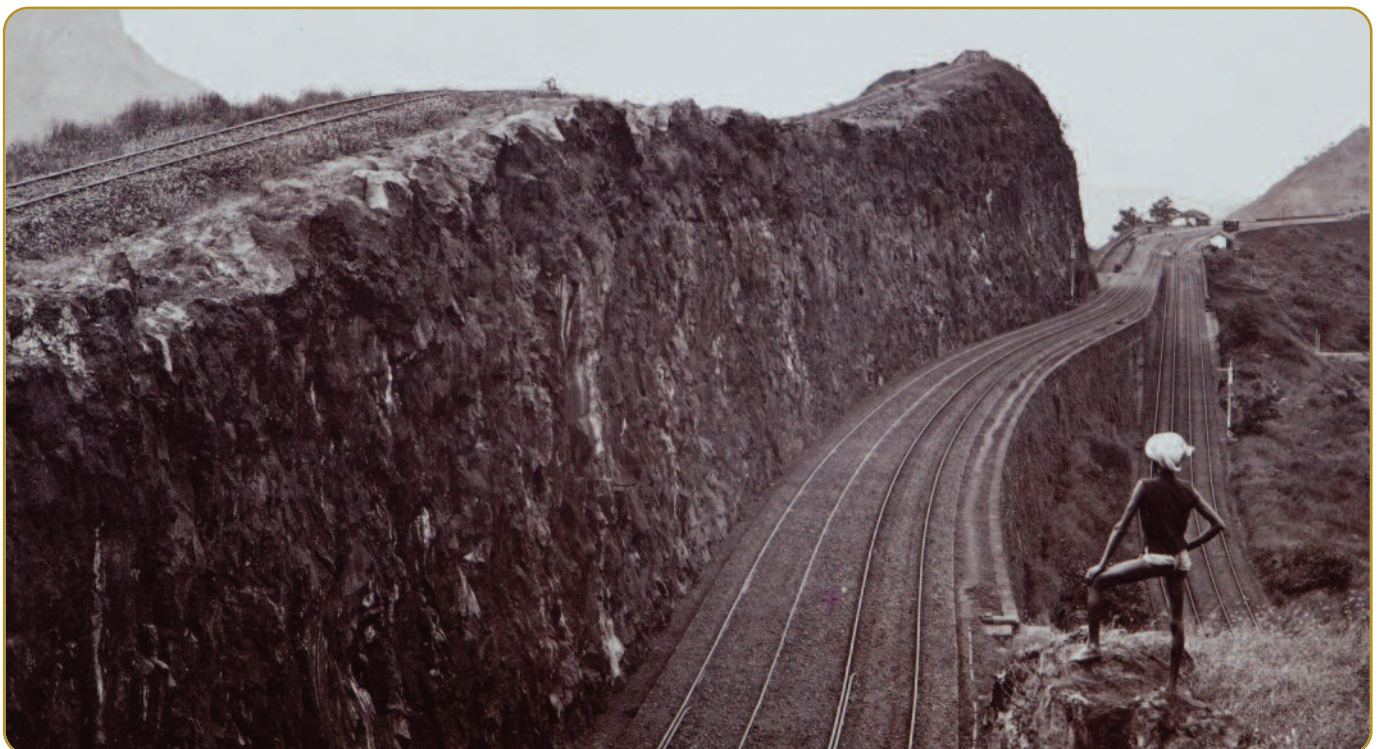
Poonah Reversing Railway