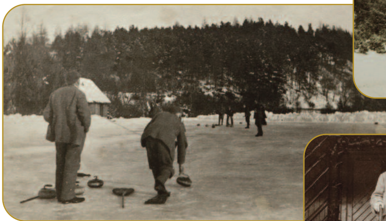
Orrin Curling rink