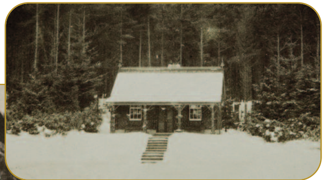
Fairburn curling rink