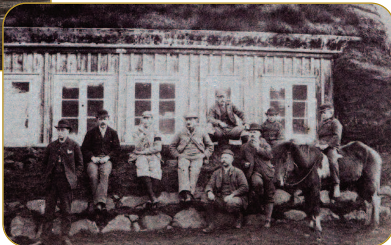
School House, Reynevelliv