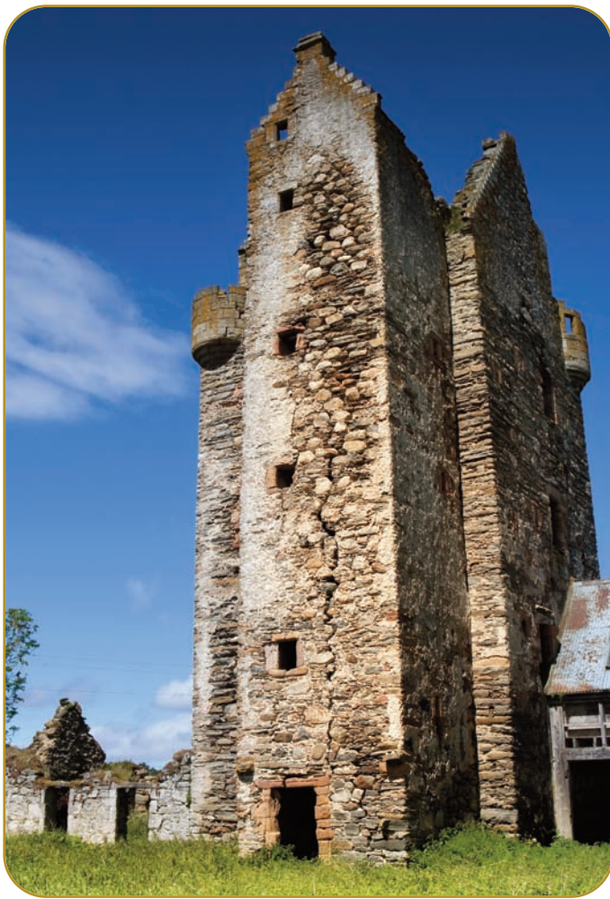
Fairburn Tower 2011