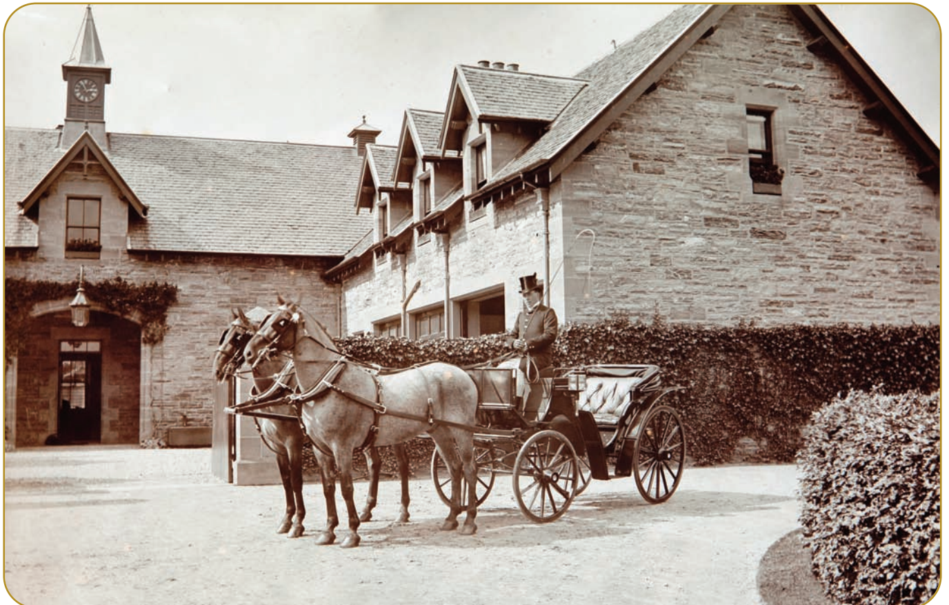
Carriage at the Stables of Fairburn House