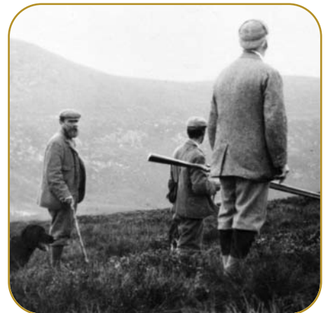
On the hill