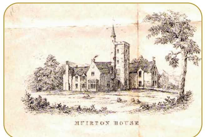
Muirton House which was demolished to make way for Fairburn House