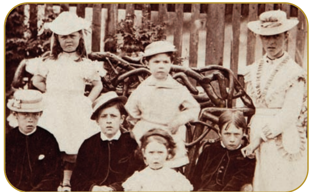
The Stirling children