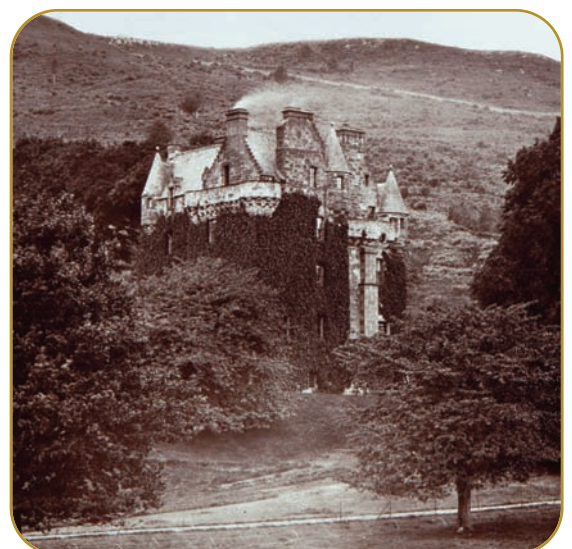
Castle Leod, Strathpeffer