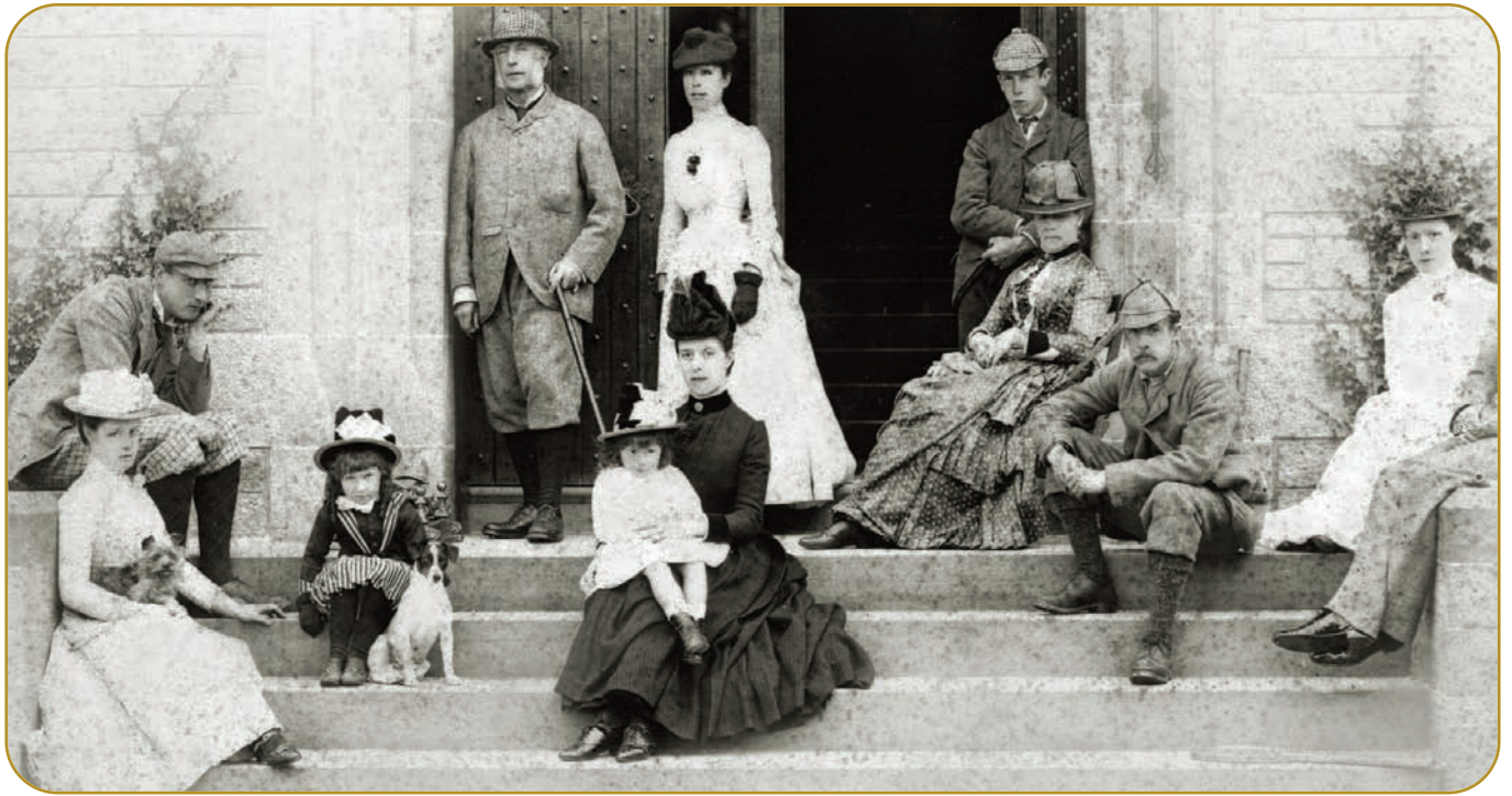
The family on the steps of Fairburn House